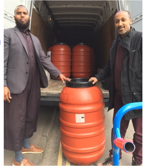
Our barrel is loaded onto the van for the first step of the journey to Somalia.

Please donate cans of soup, tuna, peas, veg, beans.