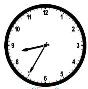
25 to 0