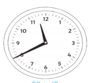
20 to 12