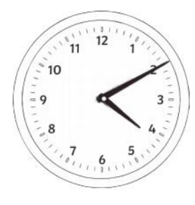
10 past 4