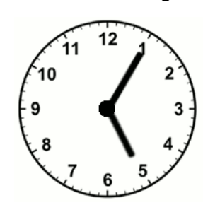
5 past 5